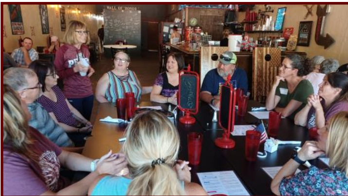
PHS Class of '91 reunion in September 2021.